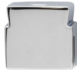
ComfortFlo Steam Head