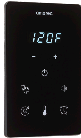
K2 Touchscreen Control