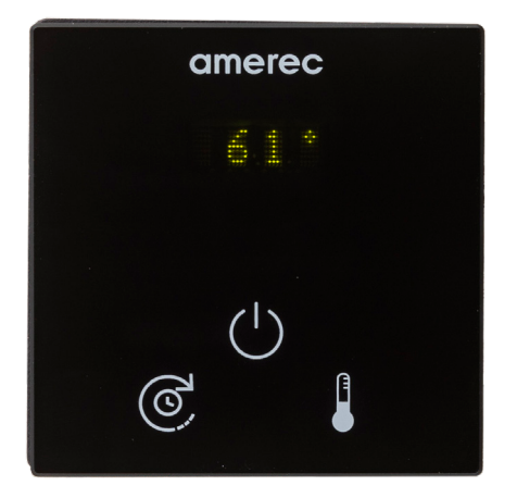
K3 Digital Control

Not intended for use as installation instructions. Refer to specific generator model installation instructions for further detail.