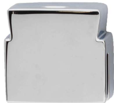
ComfortFlo Steam Head 2-3/4"H x 3"W x 1-7/16"D

Only one KT3 may be installed and it must be mounted in the steam room.