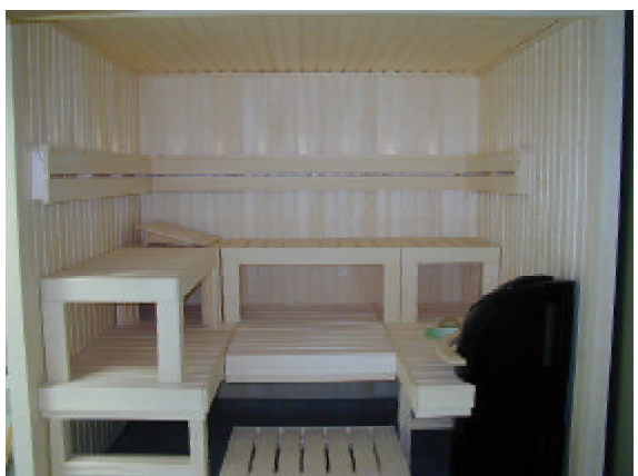
01/11/06 R.D. WVA