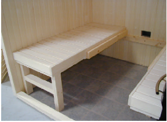
Third, put the middle decking into place. Once the decking is set, the upper (modular) benching can be placed on top. (Middle deck is removable for cleaning.)

Note: The legs shown on the bottom benches are used for photo purposes and will not come with the room. Instead there will be front wall supports that the decking will rest on.